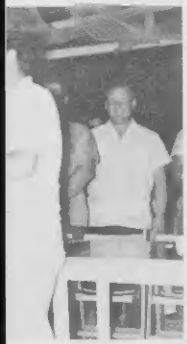
los Sailfish also ere presented by r.